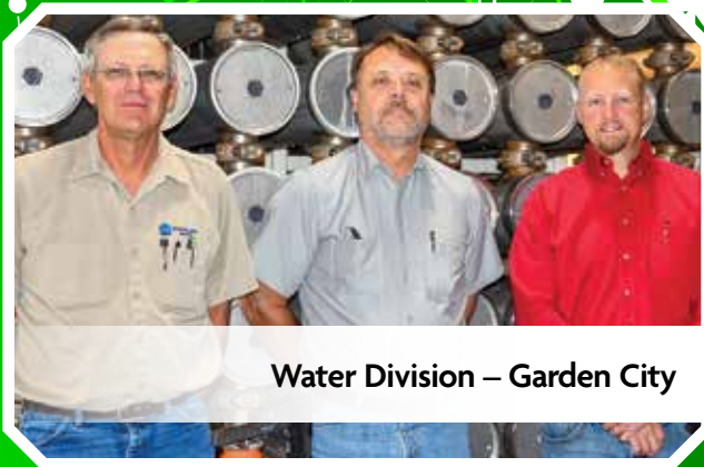
Water Division – Garden City