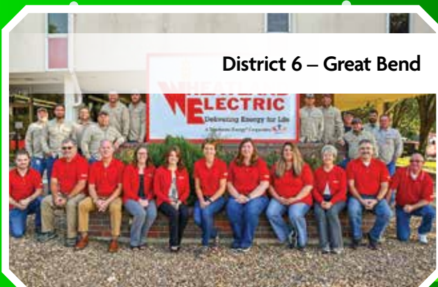
District 6 – Great Bend