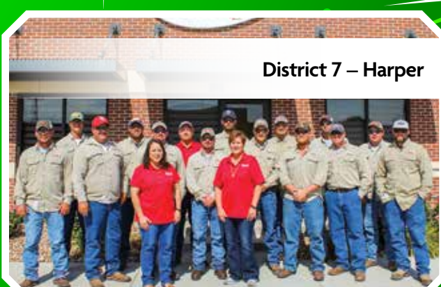
District 7 – Harper