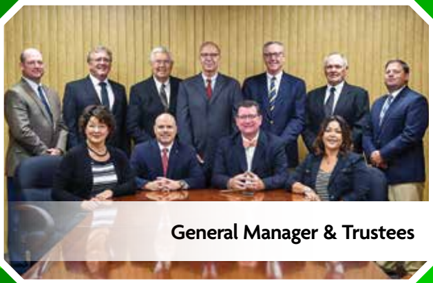
General Manager & Trustees