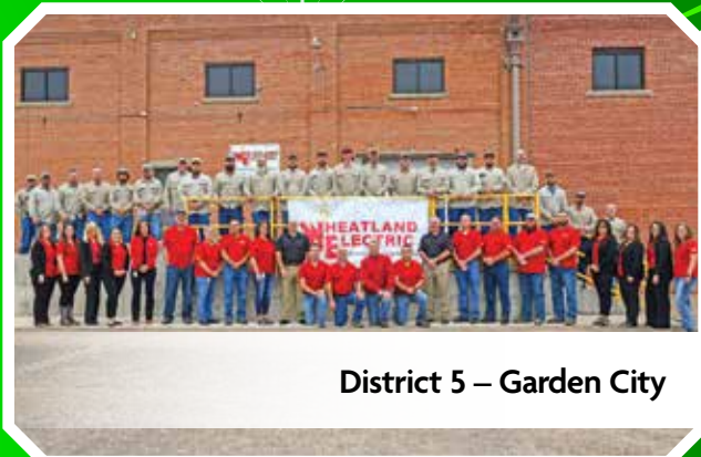
District 5 – Garden City