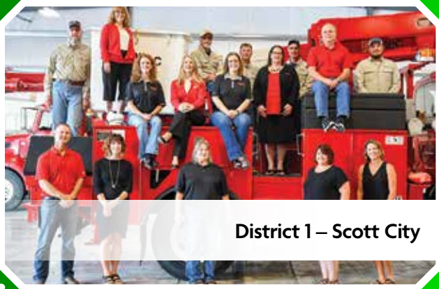
District 1 – Scott City