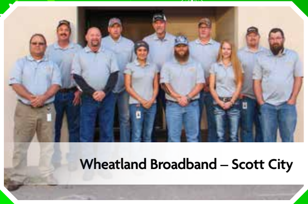
Wheatland Broadband – Scott City