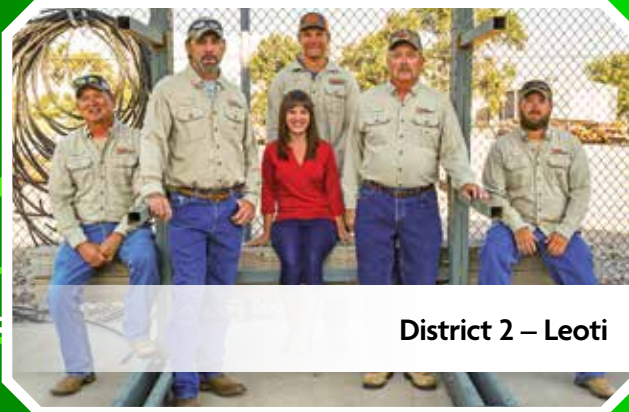
District 2 – Leoti