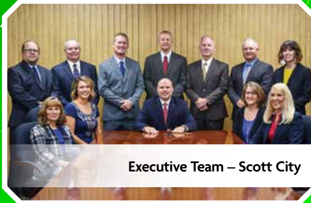
Executive Team – Scott City