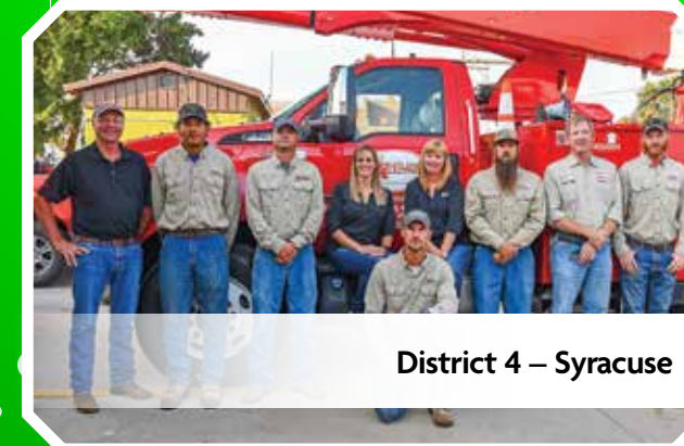
District 4 – Syracuse

Wishing You And HAPPY H MERRY & CHRISTMAS